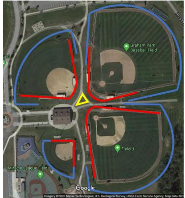
Figure 2 – Graham Park Fields I, J H, and K (Tball)