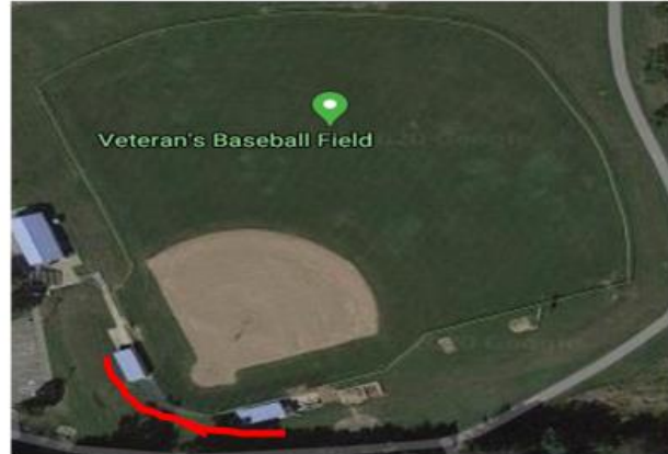
Figure 4 – North Boundary Park Veterans Field