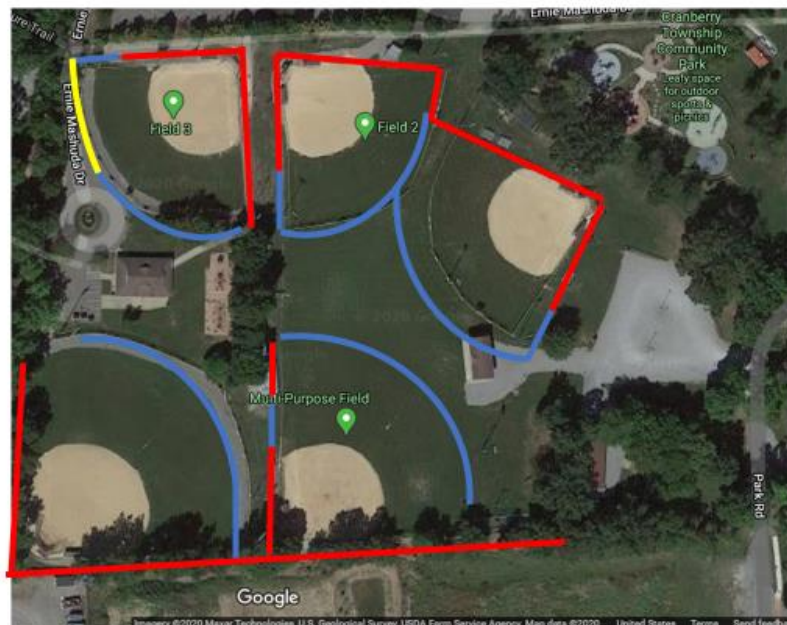
Figure 1 - Community Park Fields 1,2,3,4 and 5